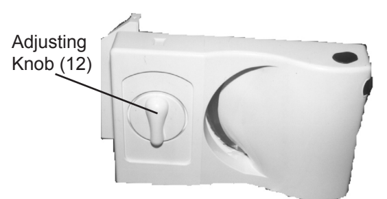
Figure 2-Adjusting Knob

Note: Locate the Food Slicer on a non-slip counter surface. The person using the Food Slicer will be positioned in the area behind the Food Tray (2). The person's left hand will be on the Food Pusher (3) with thumb behind the thumb guard. The person's right hand will be operating the Safety Button (8) and the ON / OFF Button (7).